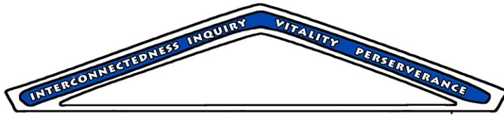
The Roof FLCC

Faculty created & defined, these four core values are what make FLCC unique. Our institutional learning outcomes (ILOs), passed through governance in Spring 15, comprise the roof of our educational model to symbolize how a student's experience of our curriculum, while gaining support from SUNY and Middle States, is sheltered under a shared philosophy.