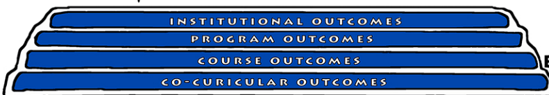
The Steps STUDENT EXPERIENCE

Required for all bachelor's degree candidates, every four-year SUNY campus has a Gen Ed curriculum designed to provide a solid academic foundation and make transfers within SUNY as smooth and seamless as possible.